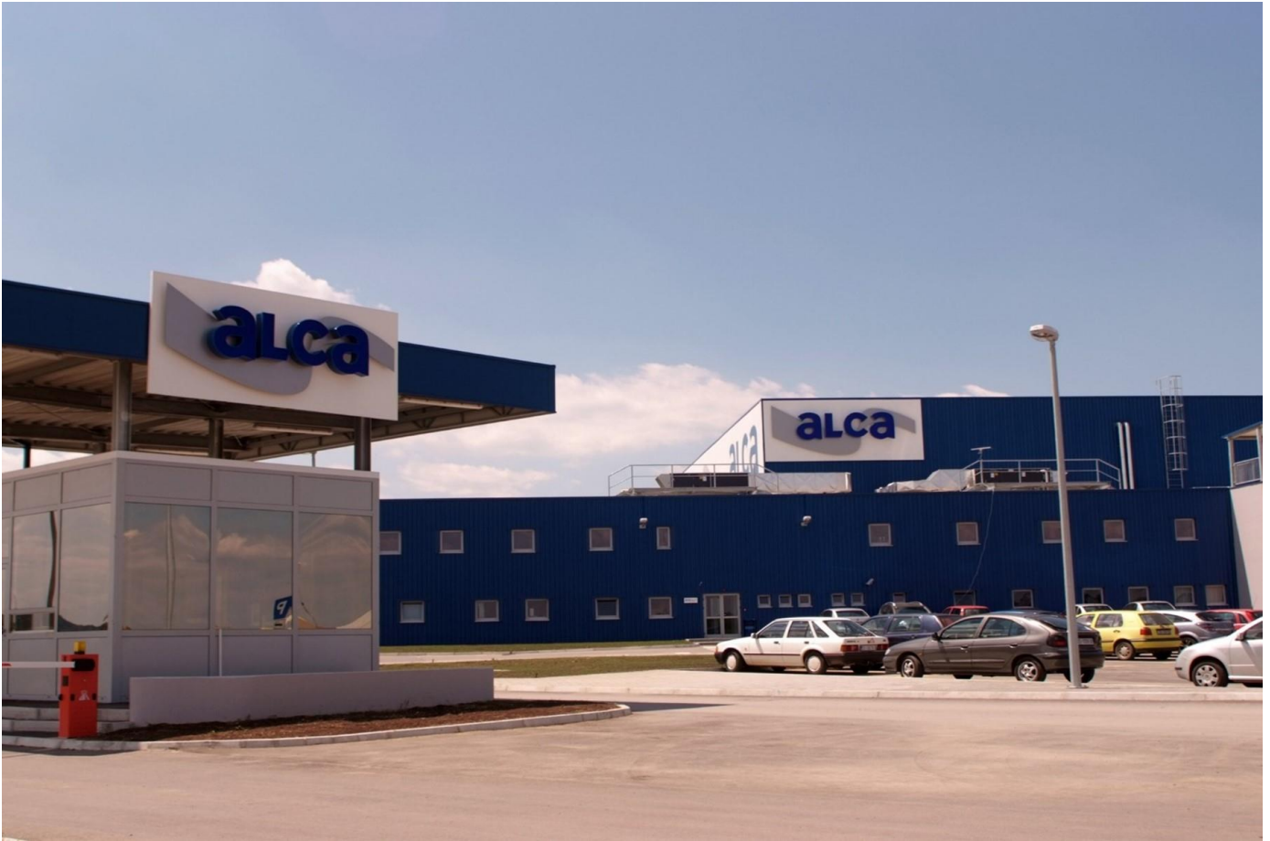
Alca Zagreb d.o.o., Zagreb, Croatia.

Founded in 1990 in Zagreb, Croatia, Alca Zagreb d.o.o. is a private company that provides sales, logistics, and production services. Alca Zagreb has more than 1,200 employees and operates with annual revenues of approximately 133 million EUR.